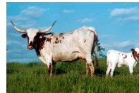
J.R. GRAND SLAM