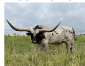
BL RIO CATCHIT